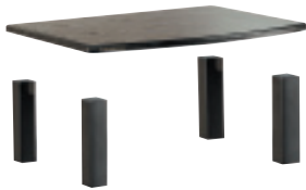
XT-AA1 (Black Oak) <B>