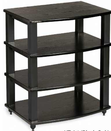
XT-A4 (Black Oak) <B>

NOTE: All XT-V3 (44)" video units include the necessary hardware to allow you to assemble the unit with or without the mid-shelf center tube (for center-channel considerations).