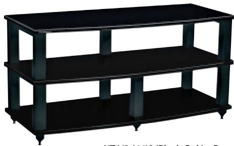
XT-V3 (44)" (Black Oak) <B> (without center tube installed)