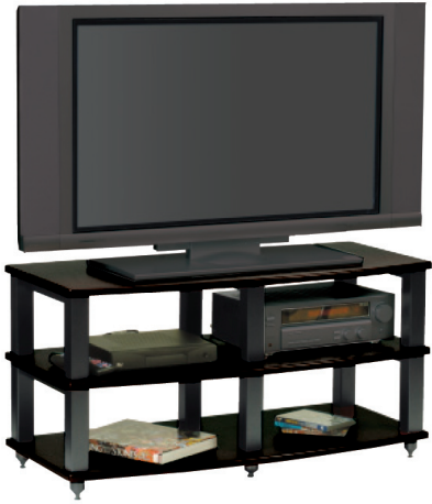
XT-V3 (44)" (Black Oak) <B> (with center tube installed)

NOTE: All XT-V3 (44)" video units include the necessary hardware to allow you to assemble the unit with or without the mid-shelf center tube (for center-channel considerations).