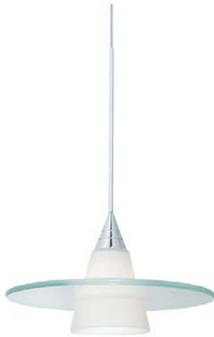
Shown with G517 Shade