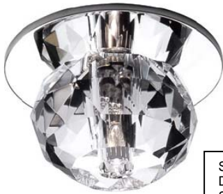
Shown with DR-363 Shade