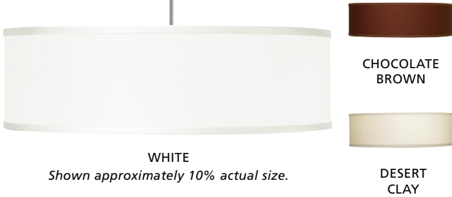
WHITE Shown approximately 10% actual size.