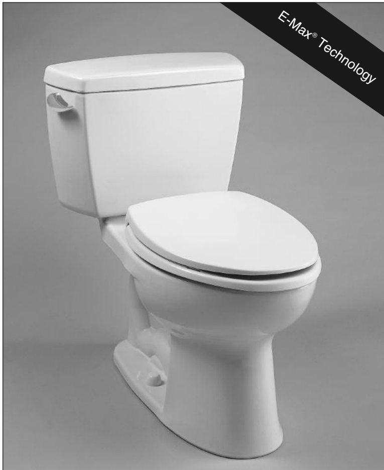
CST744EG - Eco Drake® Toilet SS114 - SoftClose® Seat