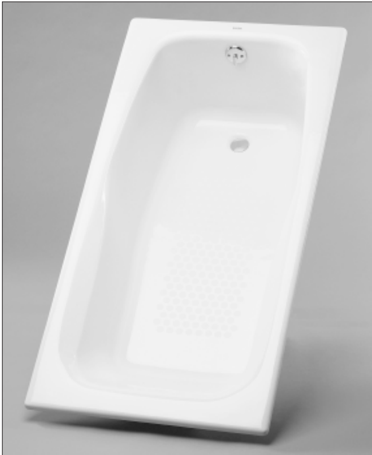
FBY1700P - Cast Iron Bathtub