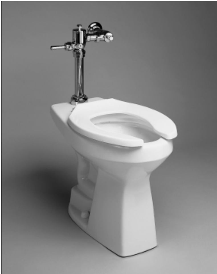
CT 705L - Flushometer Toilet - ADA Compliant SC534 - Commercial Toilet Seat TMT1HNC - 32 - Manual Toilet Flushometer Valve