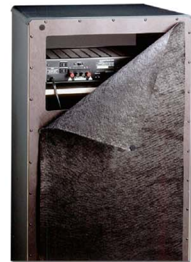
Easy access to wire management