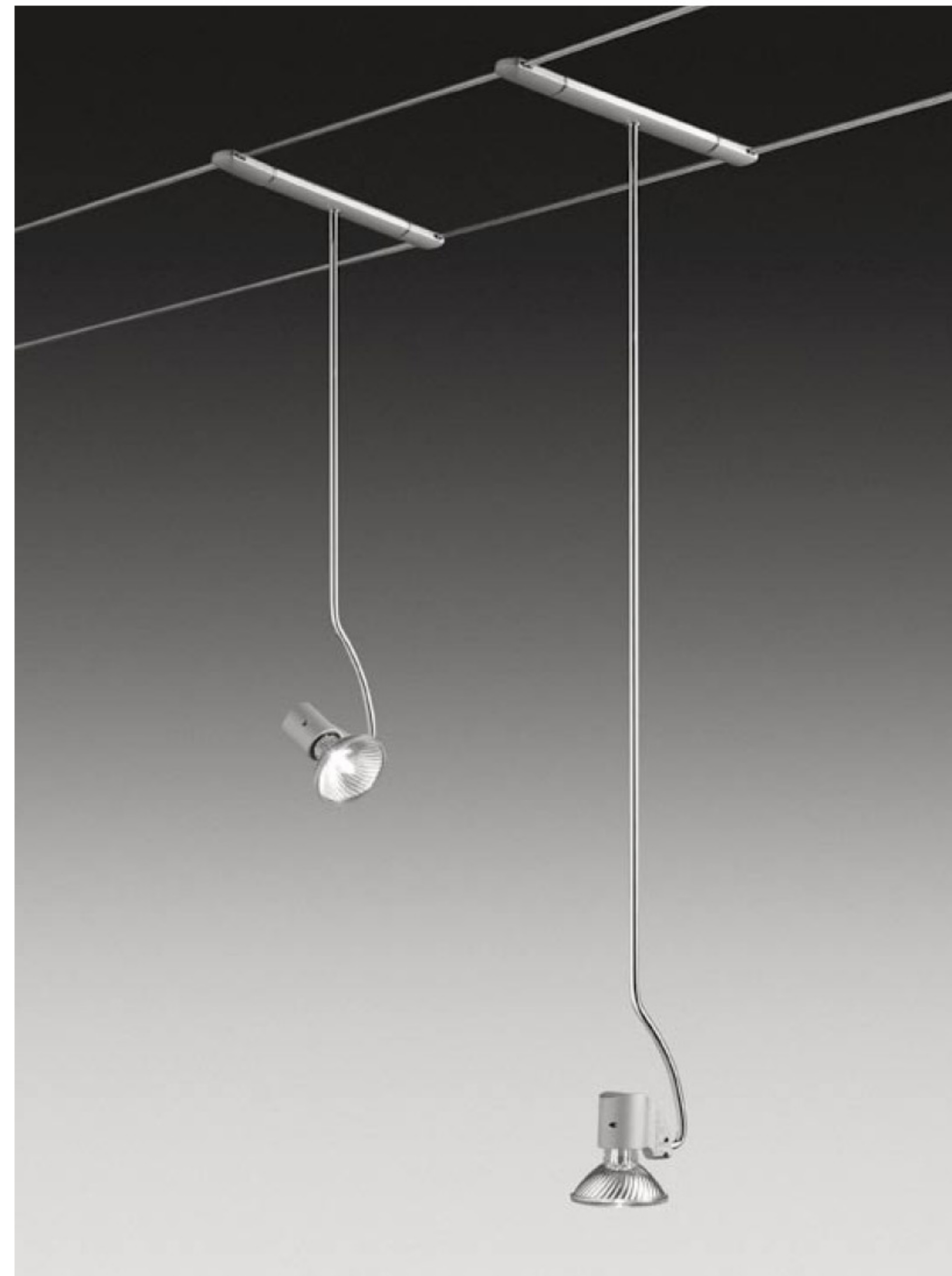
Bridge Spot Tige

BRI SPT 03 12"½ length x 4"½ wide x 43"½ height