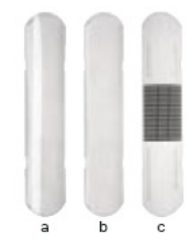
BRI HAL top and bottom glass a. Transparent b. Sandblasted c. Silk screen

BRI HAL DF Halogen Diffuser Provides general diffused light 12"½ length x 2"½ wide x 1"½ height 250W, RSC, linear halogen, 4"™ Materials | Pyrex glass diffusers Finishes | Transparent top and bottom glass; sandblasted top and bottom glass or transparent top and silk screen bottom glass