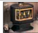
High Efficiency Gas Stoves