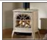
Cast Iron Gas Stoves