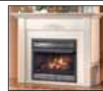
Vent Free Fireplaces