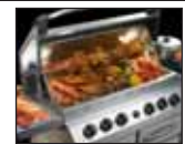
Gourmet Gas Grills

Consult your owner's manual for complete installation instructions. All specifications are subject to change without prior notice due to on-going product improvements. Products may not be exactly as shown. Patent US 5.307.801, 5.303.693, 75054-CAN.2.073.411, 2,082.915, 74589. Patents pending. ©Wolf Steel Ltd.