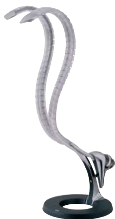
Col. 20 Policarbonato Polycarbonate Polikarbonat

Tischleuchte aus Metall und Technopolimer mit zwei unabhängig verstellbaren Armen. Licht bertragung durch Glasfaser aus Silizium. Sensor-Dimmer.