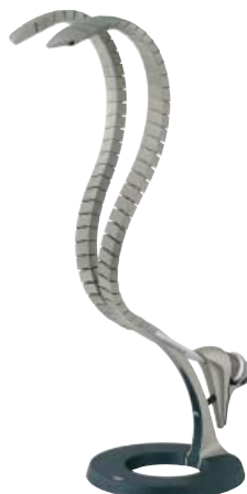
Col. 42 Nichel verniciato Nickel painted Nickel lackiert