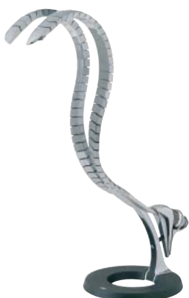
Col. 33 Lucidato cromato Chromed Chrom