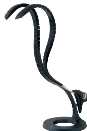
Col. 56 Manganese verniciato Manganes painted Metallic lackiert