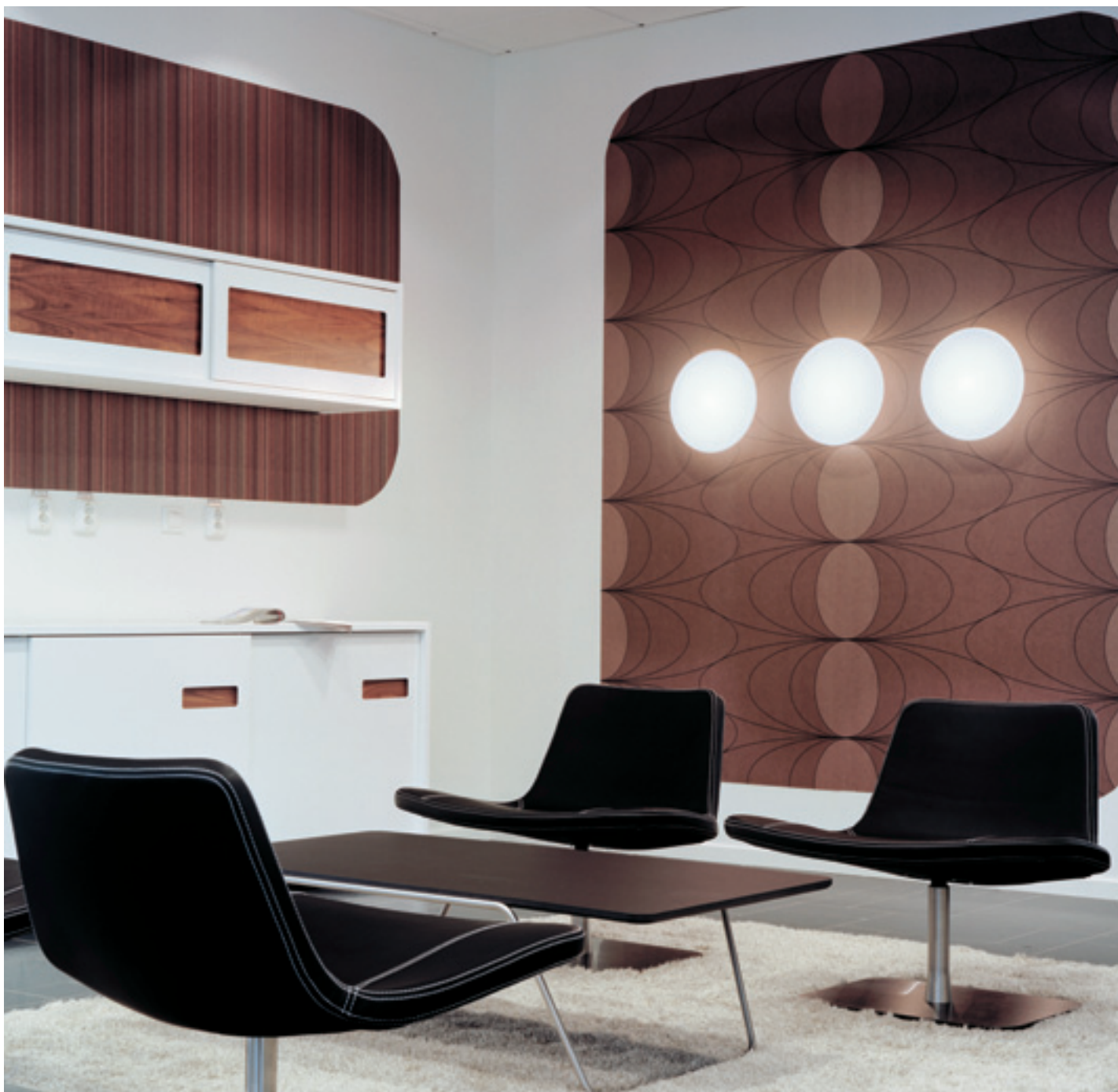
Riviera Markiser & Persienner AB Partille, Sweden Architect Thorbjörnsson+Edgren Arkitektkontor Lighting Designer Thorbjörnsson+Edgren Arkitektkontor