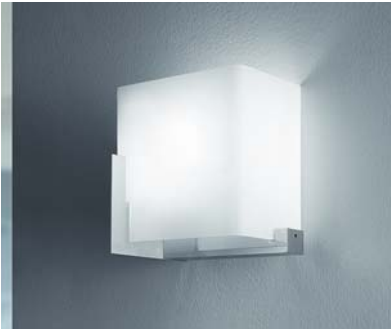
Manhattan P24 (Satin White)