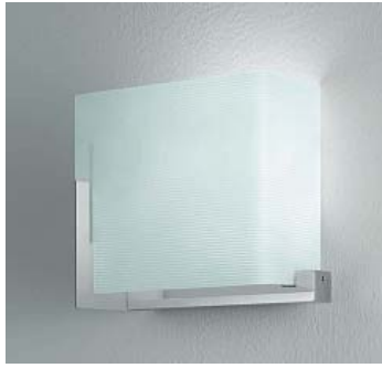
Manhattan P24 (Ribbed Pale Green)