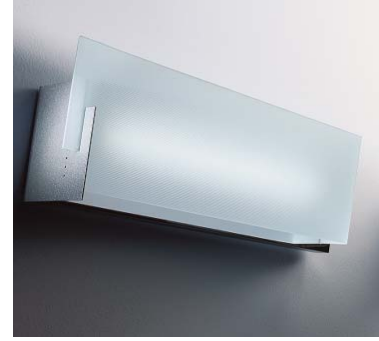
Manhattan P53 (Ribbed Pale Green)