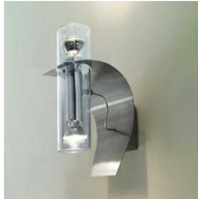
transparent light blue