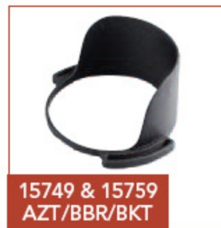
15749 & 15759 AZT/BBR/BKT