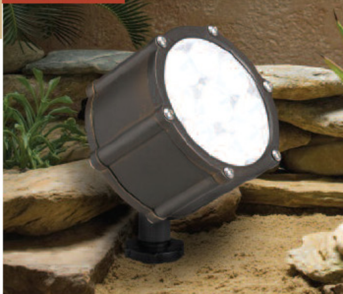
15731, 15732, 15741, 15742, 15743, 15751, 15752, 15753 AZT/BBR/BKT