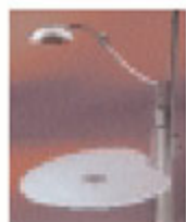
optional glass table attachment