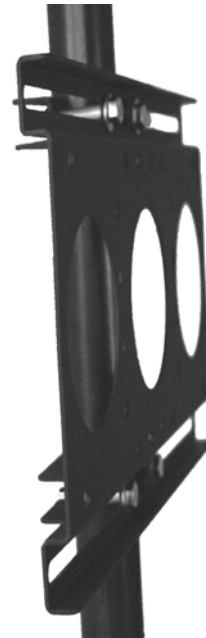
Figure 2. TPK-1 Pole Mount Example