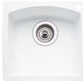
MODEL 511-636 Shown