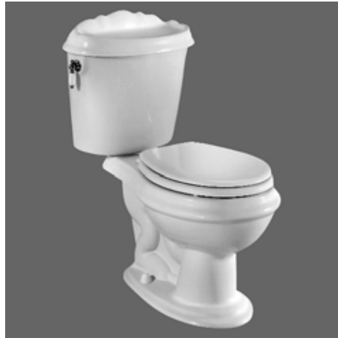
Shown with 5308.014 "Laurel" seat