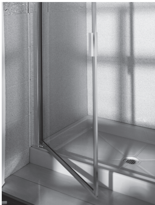
Shown with 4834.ST Shower Base and 4834.STE2 Shower Enclosure (not included)