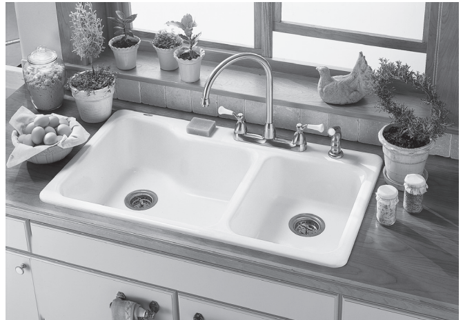
Top mount model (faucet not included)

SEE REVERSE SIDE FOR ROUGHING-IN DIMENSIONS