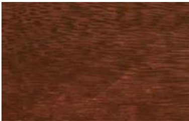
color 775 merbau