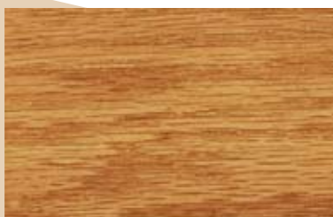
color 836 buttered rum