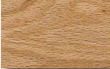
color 766 red oak natural