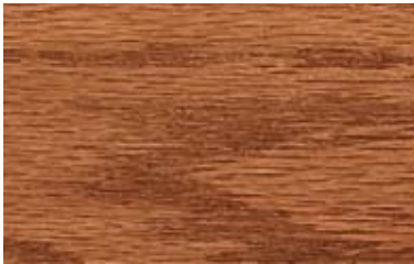
color 772 gunstock oak