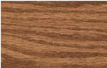
color 769 saddle