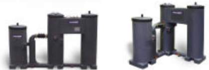
To conform to available space, the POSEXT can be configured in-line or at a right angle to the POS 1251 Oil/Water Separator.