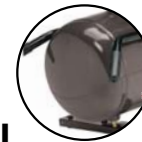
17 gallon, ASME tank