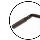
"EZ" lift handles