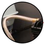
Flexible Steel Braided Exhaust Tube