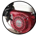
Honda® GX 160 engine