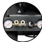
Integrated protective control panel