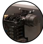
Cast Iron, oil-lubricated pump