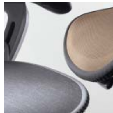
User-controlled seat depth