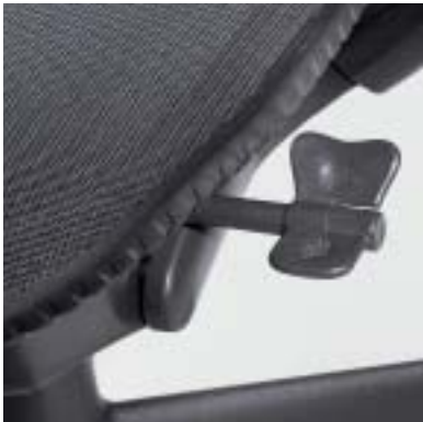
Fitting the sitter and task