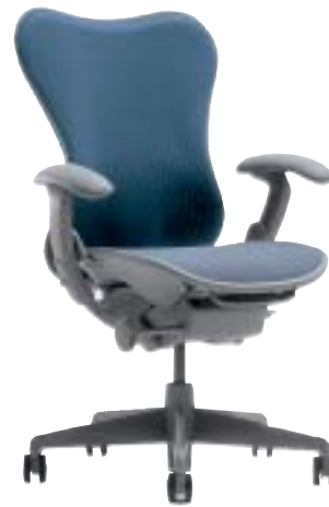
Mirra chair with upholstered back option