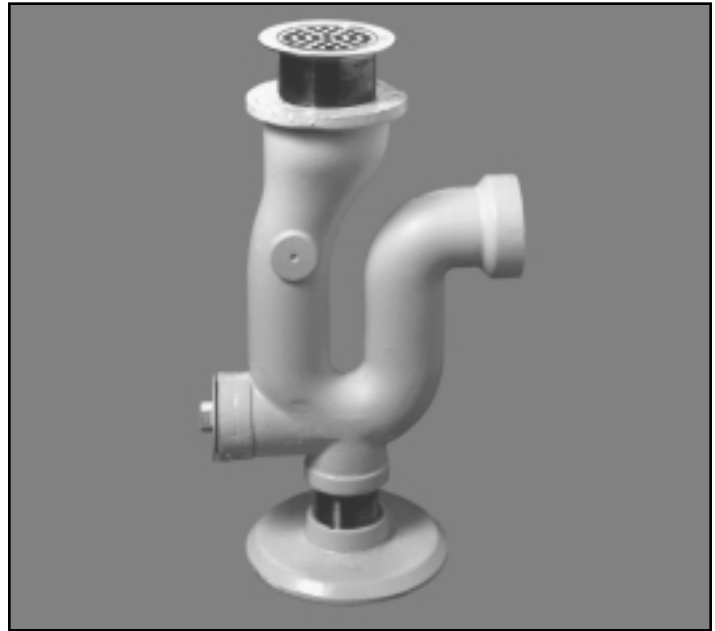
7798.020 / .030 IS FOR ENAMELED IRON SERVICE SINK

Compliance Certifications - Meets or Exceeds the Following Specifications: • ASME A112.19.1 for Cast Iron Plumbing Fixtures